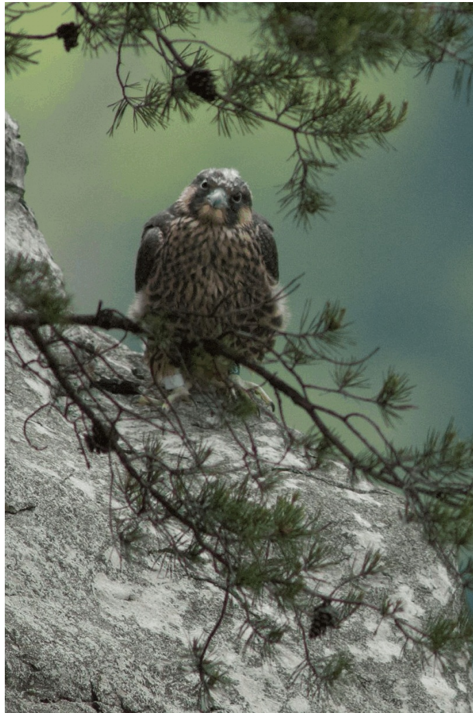
2008 young peregrine in the New River Gorge