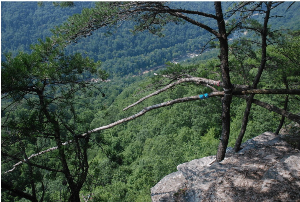
2008 view from double hack box area

An additional 2 birds originally obtained for the project were removed prior to release. One bird was kept at Three Rivers Avian Center because of a trichomoniasis infestation of the mouth and throat. The second falcon was suffering from an avulsed hallux talon at the time of acquisition and was transferred to a falconer for care pending recovery.