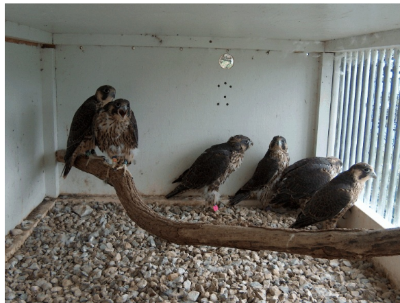
Peregrines in hack box 2 ready for release in June 2008.

A very special thank you to Greg Phillips - NERI for his help with web cams and peregrine satellite tracking.