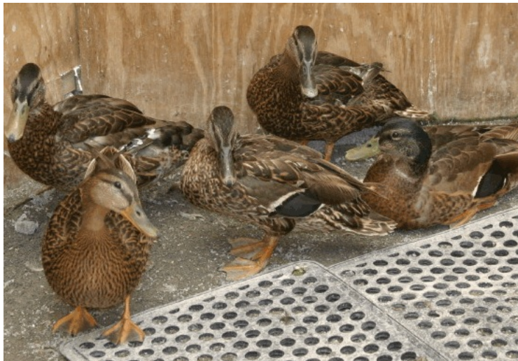
7/28/2010 Five mallard ducks, recovered from immersion in diesel fuel in the Bluefield area, are ready to go to their new home in the New River at the foot of the Bluestone Dam.

Oblinger and her father Mark couldn't have known what lay in store for them when they came to TRAC's 20 th