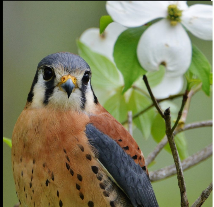
Photo of Gimli, TRAC American Kestrel Ambassador